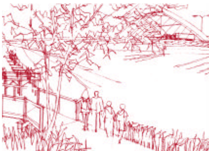
Future Riverfront Walk