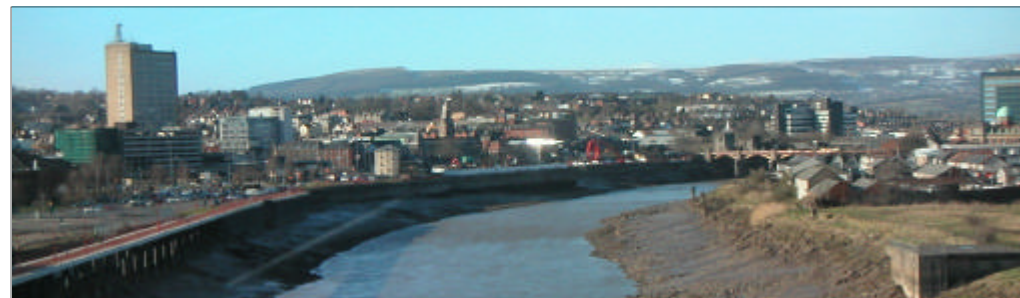
Newport City Centre Today