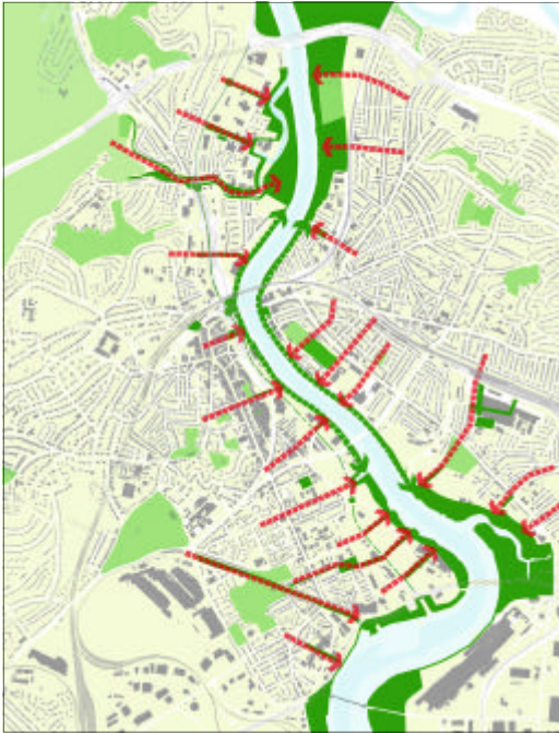
Maximise Connections to the Riverfront