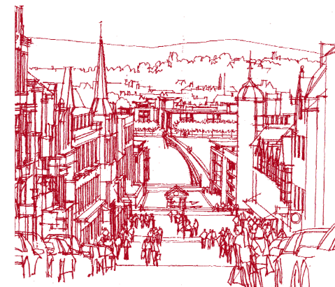
Improved Connections to the River