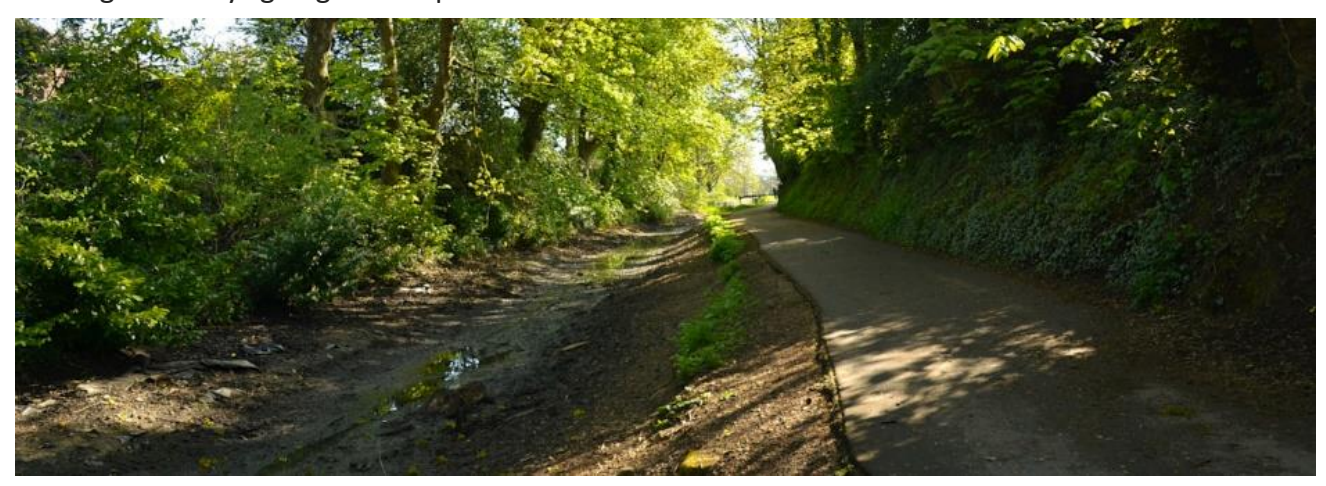
Dry canal just north of the Fourteen Locks Canal Centre

Water Shortages – this year the canal has had periods of very low water levels with parts of the Crumlin Arm and parts of the Main Line north of Newport drying out completely. We are grateful for members of the public who have contacted us and who have also contacted the canal owners to report the issues. We published a news item on our website in May 2021 explaining why the canal is so susceptible when rainfall is low. Given the structural issues that parts of the canal have, then water shortage is always going to be a problem. We continue to work with the canal owners on this issue.