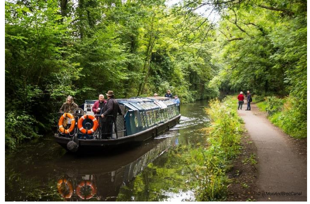
The Lord Raglan south of Pontymoile

year we have been unable to operate the boat due to Welsh Government Covid19 guidelines. The boat has also been undergoing MCA Certification which is required to operate with more than 12 passengers. This was completed successfully in August 2021.