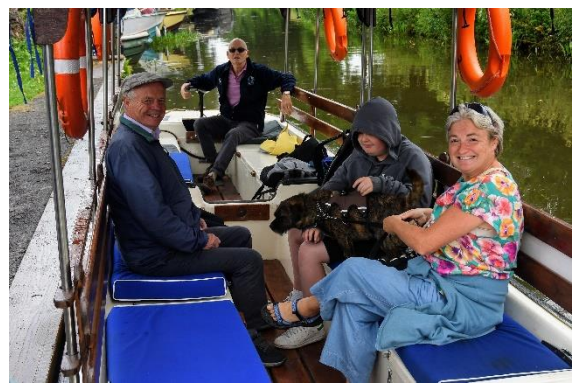
Passengers on the Edith-Elizabeth

The Lord Raglan – our larger electric boat has been constrained by a number of issues. The fact that it's an enclosed boat meant that for long periods this