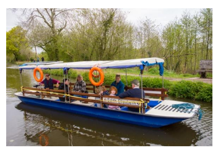
Our Edith-Elizabeth boat

It's a means of engaging with our community about the canal. It gives us an opportunity to show how beautiful it is, and to explain its