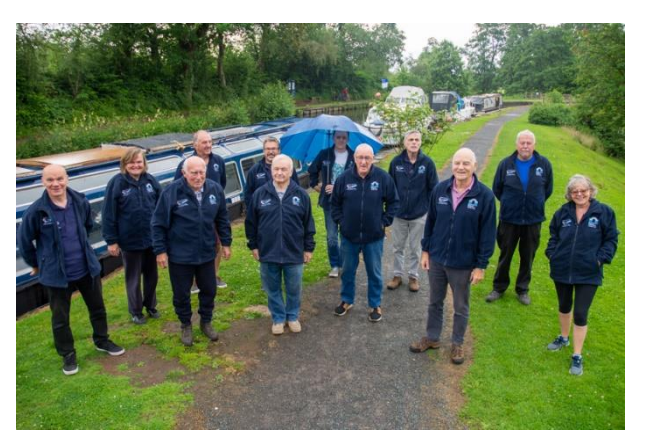
Some of our boat volunteers

This year we have had an expanding team of volunteers maintaining and running our 2 community boats at Goytre Wharf. The boats are used to promote the canals heritage and importance, not least by bringing people to the canal. The boats have also provided the Trust with a useful income this year whilst keeping the ticket price as low as possible. Our passengers and volunteers have all enjoyed being on the canal this year.