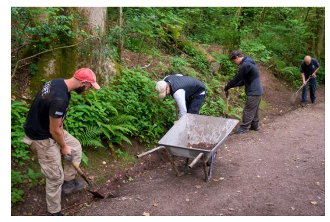
Volunteers at Alt yr yn

We have a special Partnership with Newport City Council in the Canal and Countryside Volunteer Group who work every Thursday on the Fourteen Locks flight and at the nearby Alt yr Yn Nature Reserve. Their recent work has made a great difference on the pounds between the locks.