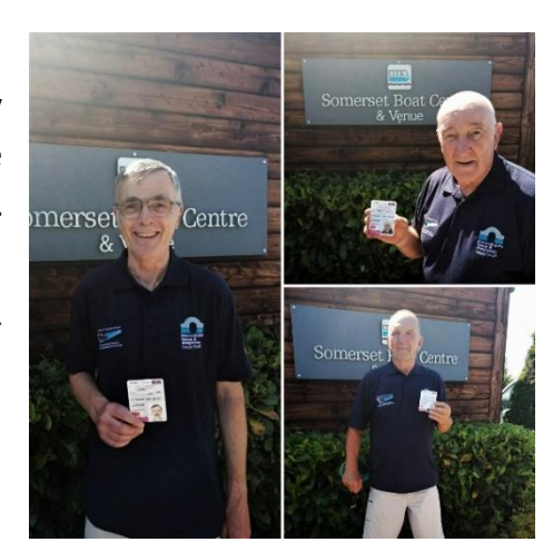
Some of our successful Helmsman

We are looking forward to being able to operate both of our boats more extensively in 2022.