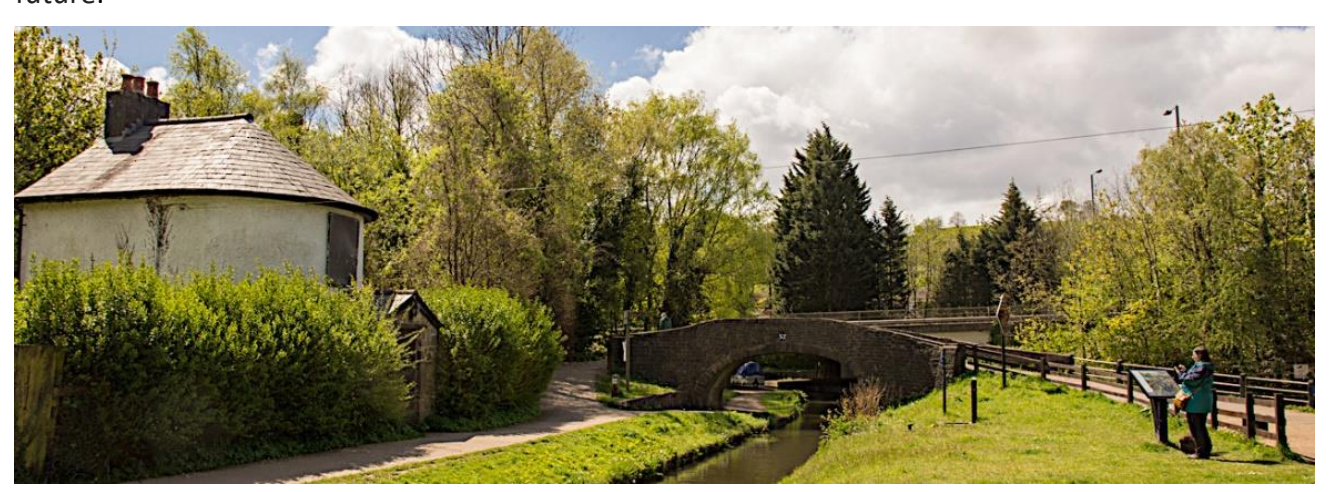
Junction House at Pontymoile

Junction House, Pontymoile – in April 2021 CRT put Junction House in Pontymoile up for sale. There was a large public outcry about this, and we also contacted CRT to express dismay at their plans. A large number of our members also contacted CRT and we are grateful for all of the comments sent to CRT. As a result CRT removed the building from the open market. We are still in contact with CRT discussing how they can safeguard the future of this historic Grade II Listed building. We would wish to see this important building back in use and open to the public in some way that safeguards its future.